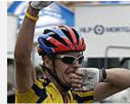
Jayco Bay Classic 3